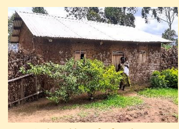
Everyone is suffering from the immense price increases caused by the war in Ukraine. The cost of food has risen by between 33% and 50% in the last few years. The price of school materials such as exercise books and pens